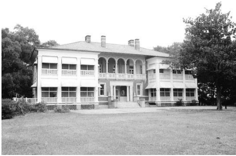
Inset photo is Quarters H-I circa 1941