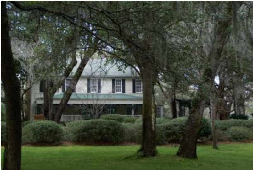
"Officers Wives" is filmed entirely in and around Charleston and the Navy Yard.