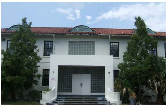
Building NH. Shipyard hospital as it appeared in 2012